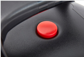
Rotation lock mechanism