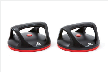
Helps achieve proper form

Designed to enhance your push-ups; the adidas Swivel Bars help to achieve a smooth, complete rep. Fitted with a ball bearing disk and rotation lock mechanism, the Swivel Push-Up Bars allow you to perform both static and dynamic movements. Designed with a gripped non-slip base, the adidas Bars provide a solid platform for your workout.