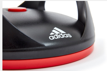
Smooth ball-bearing disc