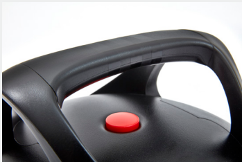
Wide grip handles