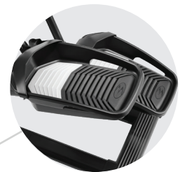
Sports Performance Pedals