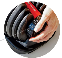
Weight Selection Dials