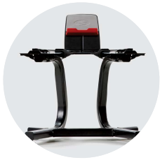
Stand With Media Rack