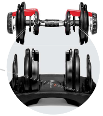
Adjust from 2 to 24 kg.