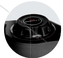
Weight Selection Dial