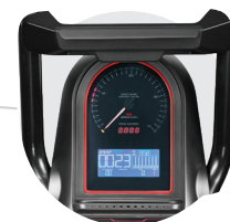
Burn Rate Dial