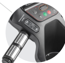
Heart Rate Hand Grips