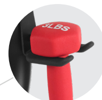
Includes 1.5 kg. Dumbbells